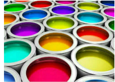
Solvent Based Decorative Paints