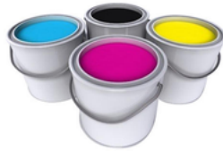
Water Based Decorative Paints