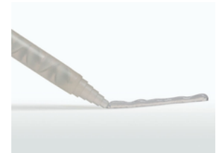
Adhesive & Sealants

Note: The data in the Technical Data Sheet represents average values which are valid and reliable but not legally binding. We will not be liable for any use of data, or any damages arising from the use of products for purposes not examined in detail.